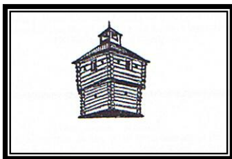
The Fort Gaines Historical Society has adopted its official